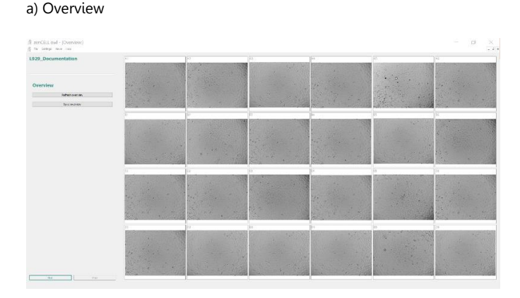
Figure 3: Documentation of culture quality for subsequent experiments at the end of cell culture phase. 24-Well cell culture plate 86 hours after seeding of L929 Fibroblasts. a) zenCELL owl software window "Overview" provides a direct comparison of the cell density and vitality of all 24 wells in parallel. b) zenCELL owl software window "Well History" shows the parameter cell coverage, adherent cell number, cell morphology for each single culture well in detail.