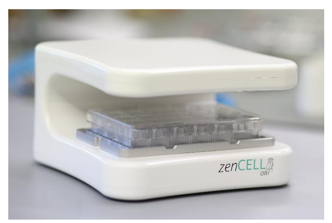
Figure 1: zenCELL owl. 24-channel microscope with 24-well cell culture plate.

Data recording is performed continuous and automated with individually defined intervals. Additionally, manual analysis of cell cultures can be conducted on demand. The software can be directly controlled with the PC connected to the zenCELL owl. Data recording takes place manually and variable at user-defined intervals. Information about cell coverage, cell count and cell morphology are recorded and analyzed. Data is stored on the local PC for subsequent analyzes and documentary purpose.